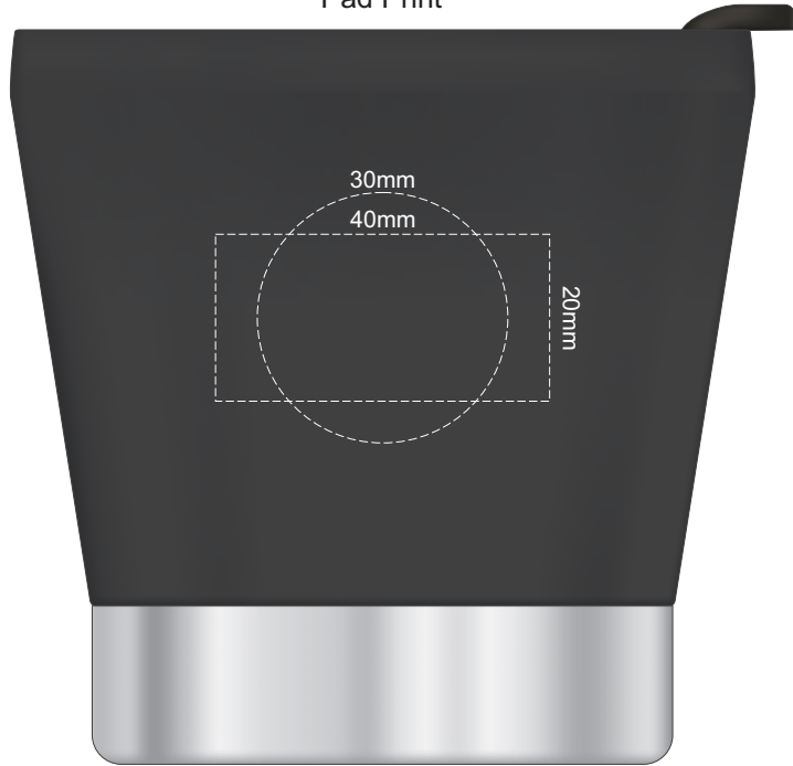
100% of Actual Size Pad Print