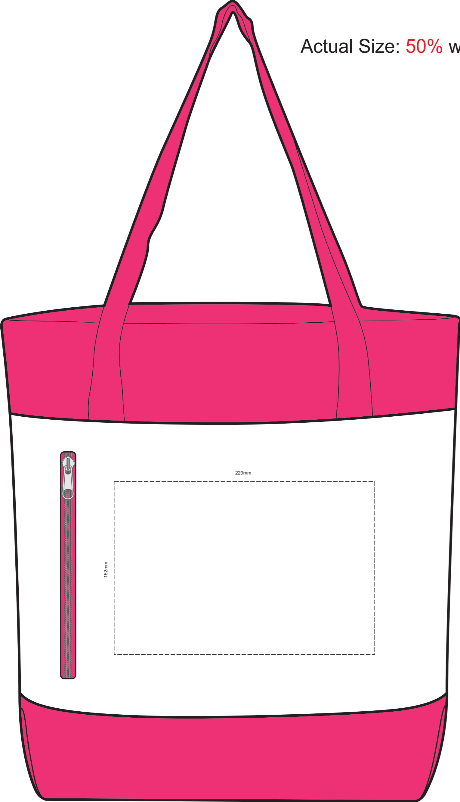
Screen Print or Digital Print